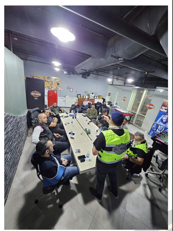
NEW MEMBERS JOINED H.O.G. QATAR CHAPTER IN FEBRUARY 2024